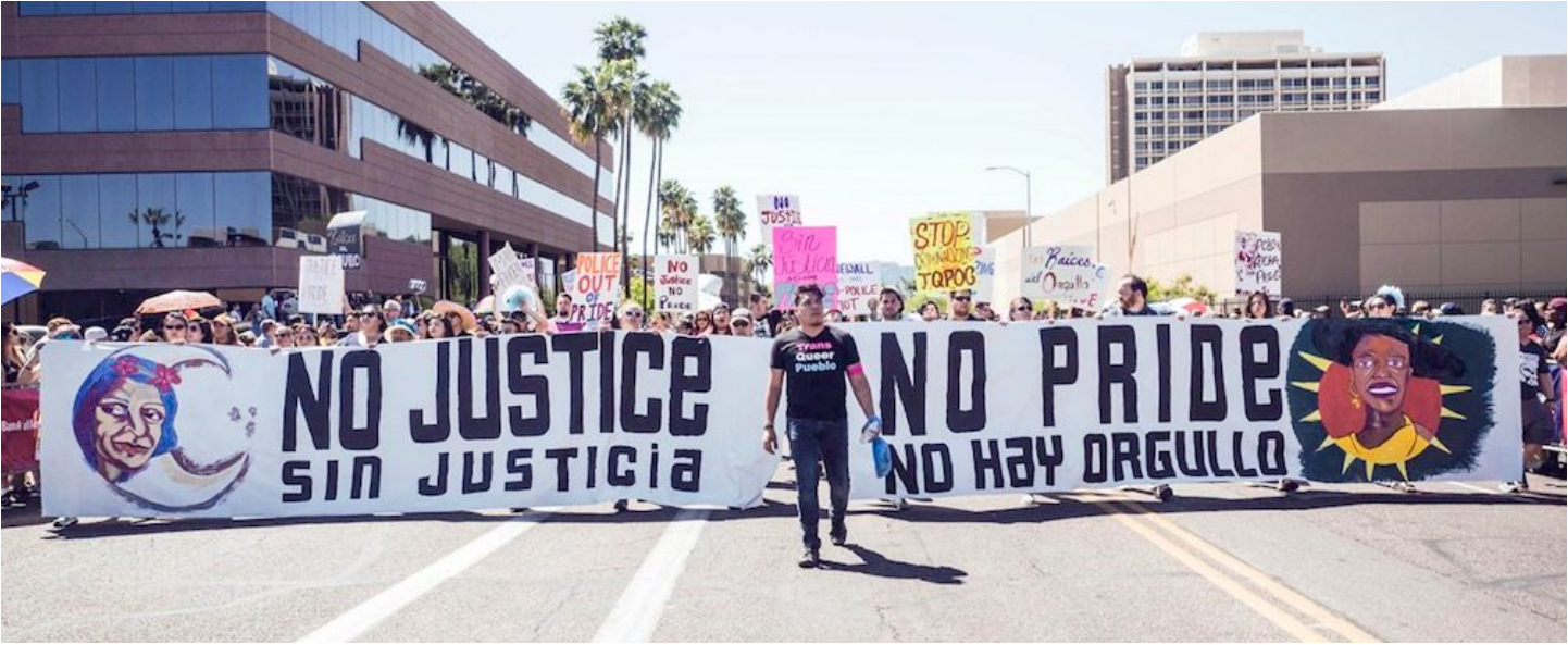
Trans Queer Pueblo (TQP) Phoenix, AZ Awarded $23,000

\[ S_Z V Tj N[ Q' fi L* é ' ožfi" ( %e° À' fi" ' (' » VZ Z VT_N[ a' V' ' \[ [ RPaPbaq" Rd ' tR_ Rfj N[ Q" Rd ' - \_Xá, H: $b[ QM T' d WY ` b] ] \_a' % i $«' d \_X' a' ` b] ] \_a' aUR' ' Y' R' & VXR_ ' ORPN_PR_NaX[ ' PNZ ] NM[ j' aUR' Ô' RR" Rd - \_X' PNZ ] NM[ ' a' \_RS_Z ' PN U' ONYj' ' ] RROf' a_VMY' N[ Q' QV PvcR_f' YNd' j' N[ Q' aUR' ~ VT[ Vaf' ' \a ~ RaR[ aX[ ' WYá\` a\ ] aURRe] N[ \_X[ \_S] \_cNaR' VZ Z VT_N[ a] \_V\ [ ' V' " Rd ' - \_X" aNaRá: